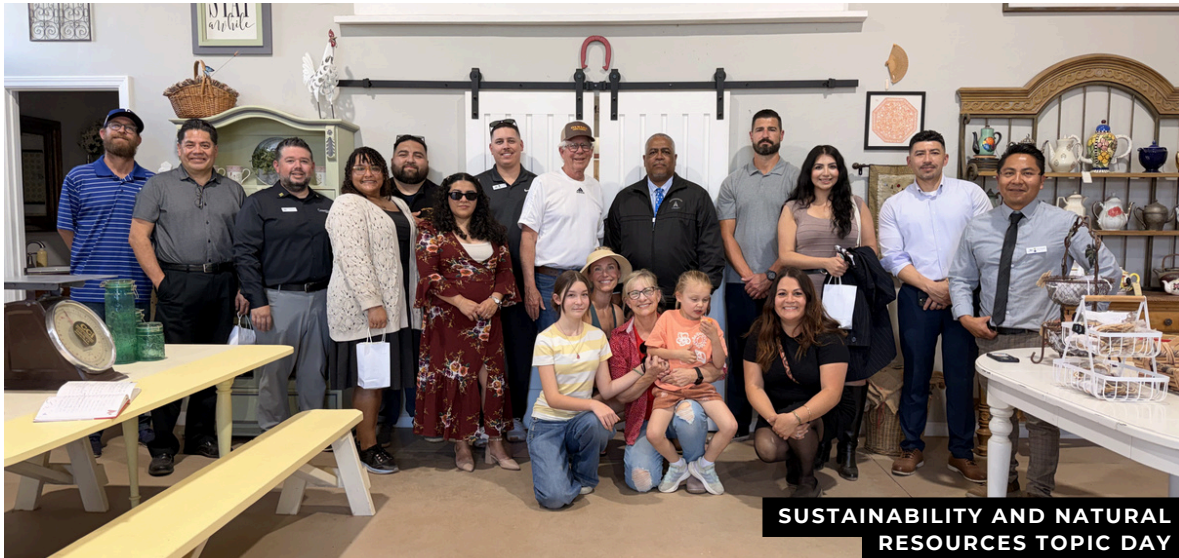
SUSTAINABILITY AND NATURAL RESOURCES TOPIC DAY